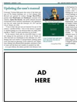
1/2 Page Ad