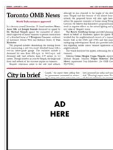
1/2 Page Ad